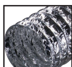
Aluminium ( )