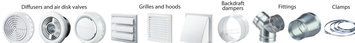
Diffusers and air disk valves